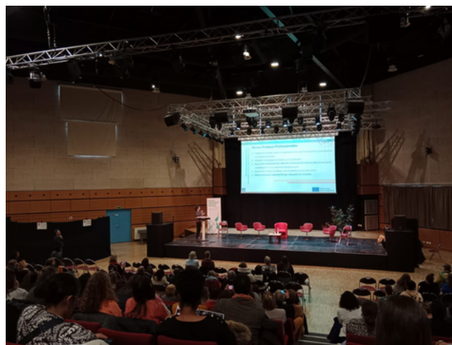
CLG presenting the F.A.C.T.S. project in France last November

The first multiplier event took place in Greece and was co-organised by project lead PLOES and project partner RECEBI. The meeting on 23 April 2024 convened a local community of experts and interested parties.