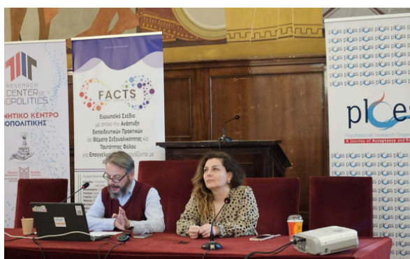
Pictured (left): PLOES presenting the project at the ME in Greece